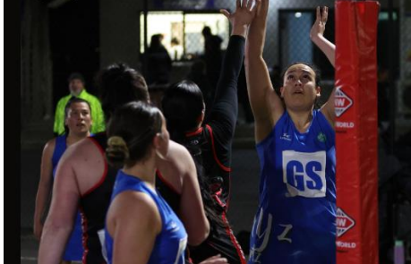
Tauranga Netball Centre Senior Competition 2023 Division 4 Winner Mayz Sportz