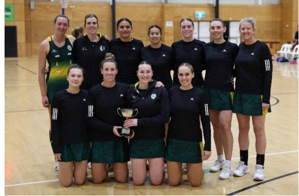
Mt Sports 1 Runners Up Senior Premier Division 1