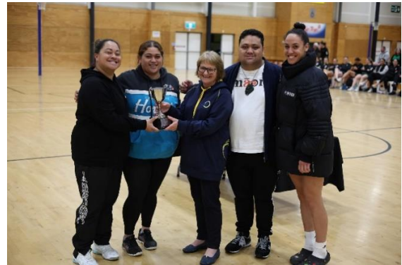
INFORCE Rangiwaea Premier Runners Up Senior Premier Division 2