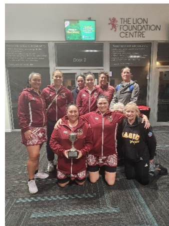
Matakana Runners Up Masters Premier