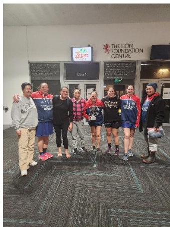
Rangiuuru Winners Masters Premier