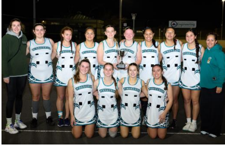
Tauranga Netball Centre Senior Competition 2023 Division 1 Winner Whareroa Kuku ki Taiatea