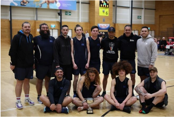
Tauranga Moana Mens Winners Senior Premier Division 1