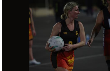
Tauranga Netball Centre Senior Competition 2023 Division 2 Runner Up Te Puke Sports Gold