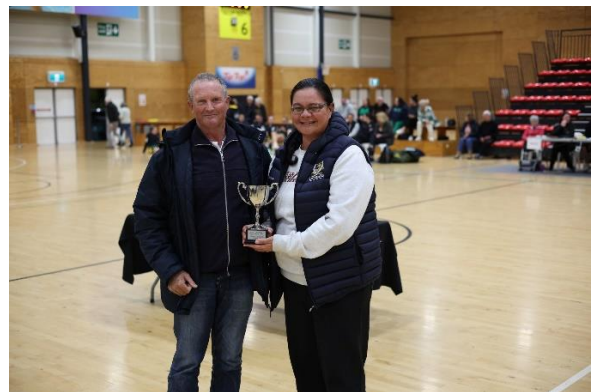
Tauranga Sports 3 Runners Up Senior Premier Division 3