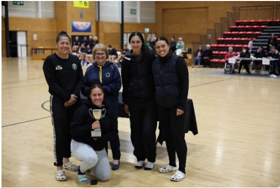
Pikiao Warriors Winners Senior Premier Division 2