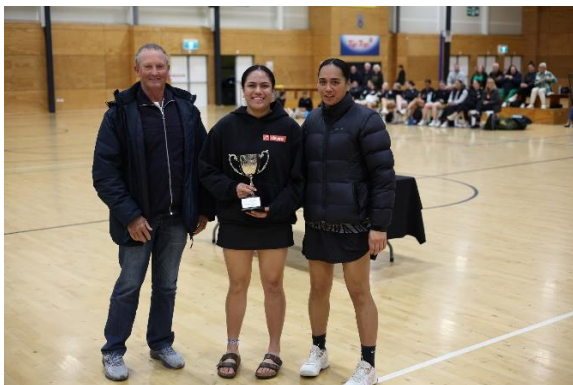
Rangataua Winners Senior Premier Division 3