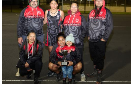
Tauranga Netball Centre Senior Competition 2023 Division 1 Runner Up Untamed Fire