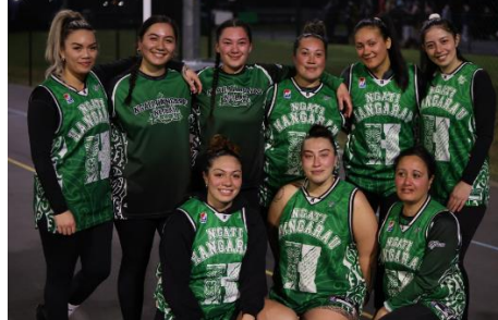
Tauranga Netball Centre Senior Competition 2023 Division 3 Runner Up Ngati Hangarau Omanawa