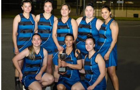
Tauranga Netball Centre Senior Competition 2023 Division 3 Winner Te Puna Blue